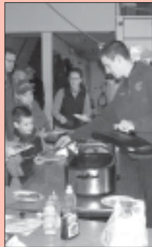
Join us for a hearty breakfast of pancakes and ham and spend some quality time with Santa at the 14th annual East Pierce Pancake Feed in Sumner.

Firefighters will also be collecting donations of nonperishable food items and new or gently used coats, gloves, scarves, hats and sleeping bags for needy families in our area.