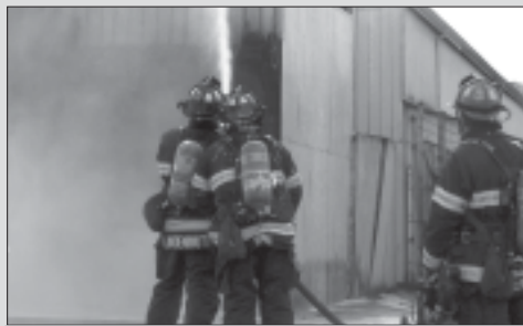
Additional crews, advanced life support for emergency medical calls and ambulance transport with no out-of-pocket expenses for the patient are just a few benefits the residents of Edgewood and Milton would see with the merger.