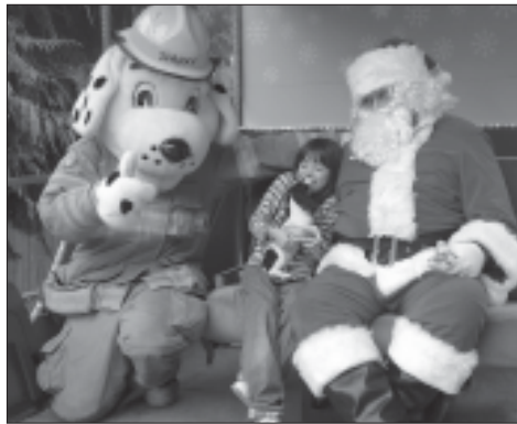
Firefighters from East Pierce Fire & Rescue, Edgewood and Milton fire departments will escort Santa around neighborhoods in their areas.

For safety, the firefighters ask that everyone stay on the sidewalk and out of the road. "Helpers will come to you," Parke said. "Watch for emergency vehicles with lights on. They will cruise a few blocks ahead of Santa's sleigh."