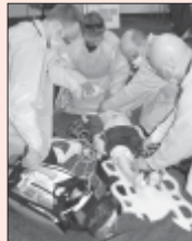
Customer feedback helps us to improve our training and the quality of our service we provide.