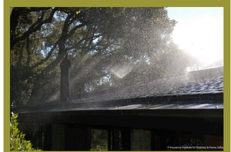
Photo 1. Roof mounted sprinkler.

Given the potential issues regarding performance, it's recommended that use be a supplement to, and not a replacement for, already proven mitigation strategies, such as the reduction of potential fuels throughout the home ignition zones, along with removal of roof and gutter debris, and use of noncombustible and fire/ember-ignition resistant building materials and installation design details.