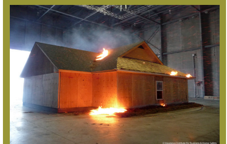
Photo 2. In order to be effective, external sprinklers must be able to wet all areas where ignition can occur, or be sufficiently effective in quenching embers that approach the home so they won't have enough energy to ignite combustible items.