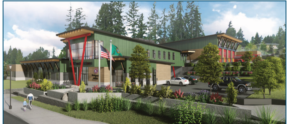
Architectural rendering of Bonney Lake's new Headquarters/Station 111 slated to open in Jan 2024.

Thank you for providing us with the equipment and facilities to serve you better. ■