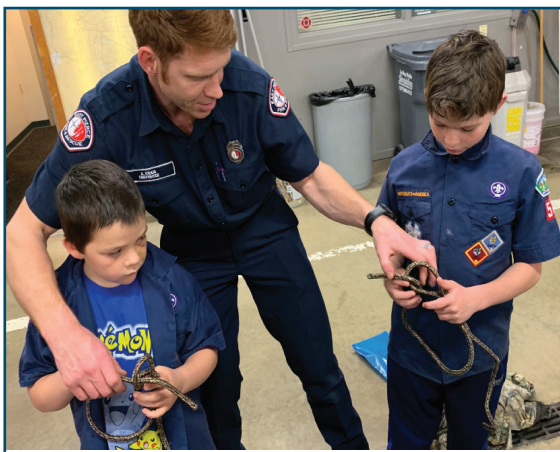
Scouts learn to tie a bowline knot at Scout Night, one of several engaging learning stations.

Advance registration is required. Visit eastpiercefirer.org for more event details and to register. ■