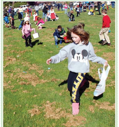
Hop on by our Easter Egg Hunts, Saturday, April 8th, sponsored by East Pierce firefighters.