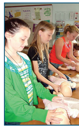
Safe Sitter students learn important life-saving CPR skills during class.

For years, adolescent babysitters have been "stepping in" for parents who are "stepping out." While many of these young people bring a desire to care for children, few are prepared for the magnitude of responsibilities they assume. EPFR teaches the Safe Sitter curriculum to help equip students with life-long skills and create future generations of safety-conscious adults and parents.