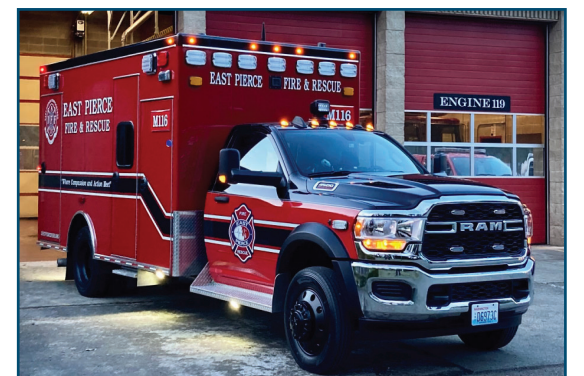
The new Medic 116 began serving the foothills communities in early February.

Medic 116, a 4WD diesel Ram 4500, is a little taller and longer than our current medic units, contains liquid spring suspension for ride comfort, a Howler Siren System (a lower tone that grabs the attention of drivers on the road), and a HAAS Alert System (a collision mitigation system that alerts both drivers and other emergency responders of an approaching emergency vehicle responding).