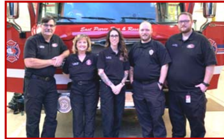
Chaplains are at the ready to support our citizens when they need it most.

EPFR has a team of five chaplains that are dispatched to calls within the fire district. Our chaplains play a vital and necessary role in providing on scene support for both our citizens and first responders.