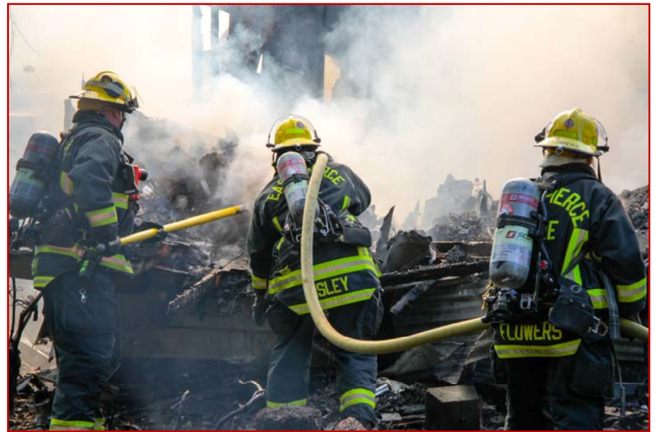
Taking a few easy steps with home heating equipment can help avoid a tragic house fire.